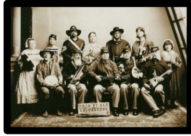
77 TH NY Regimental Balladeers